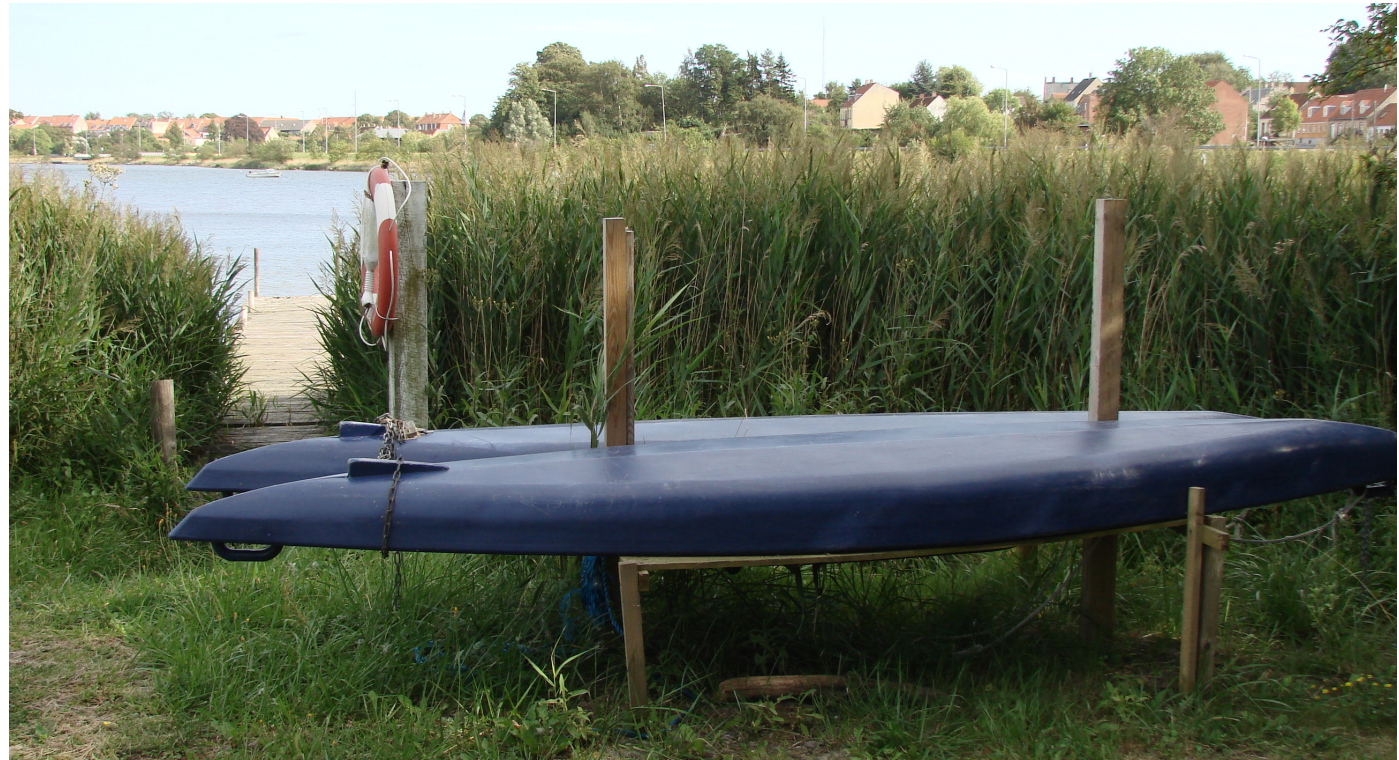
By Skælskør Nor Camping

5 Across the tidal meadow you can see the small island of Fugleholm which belongs to Gerdrup Manor, and which therefore is private property. The row of stones in the water could have been a part of a fixed link to the island. A more interesting idea could be that it is remains from a loading site for the rich settlement that was situated near Boeslunde in the late Iron Age and in the Viking Age – the period from the year 600–1000.