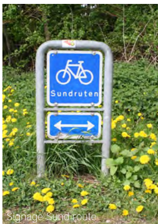
Signage Sund route