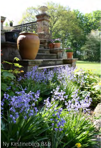
Ny Kirstineberg B&B