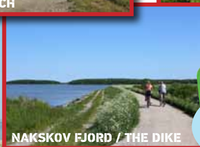
NAKSKOV FJORD / THE DIKE