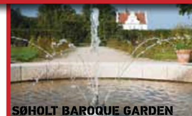
SØHOLT BAROQUE GARDEN