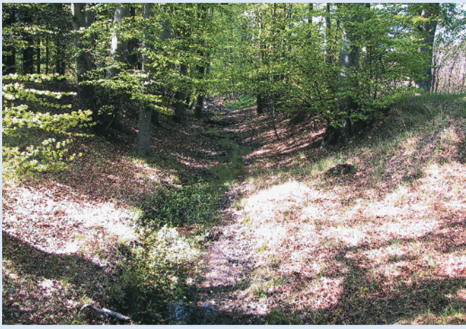
The enigmatic 'Ormerende'